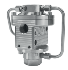
Fig. 3: Type 3755-2 (stainless steel body)