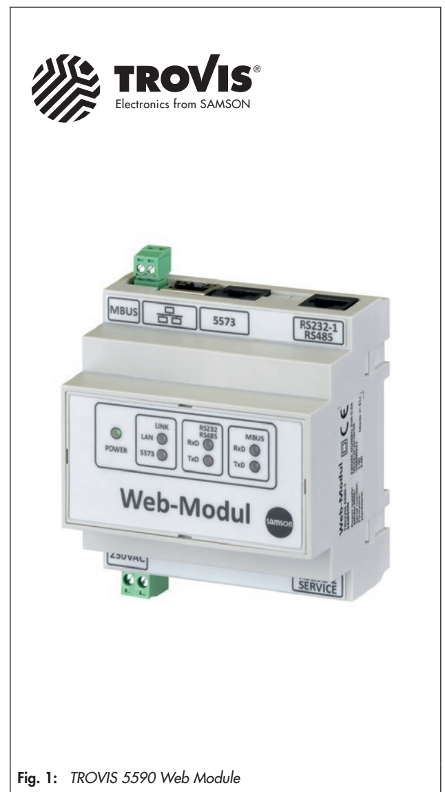
Fig. 1: TROVIS 5590 Web Module

The web module editor software tool is used to create applications for the web module. This tool allows users to configure all functions over intranet/internet and, for example, to alter user access rights and e-mail addresses.